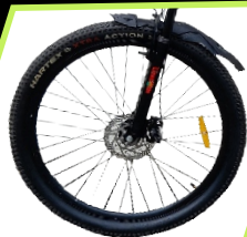
27.5 Wheel Double Wall Alloy Rim