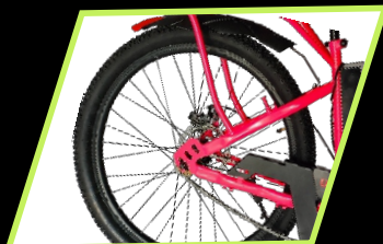
27.5 Wheel Double Wall Alloy Rim