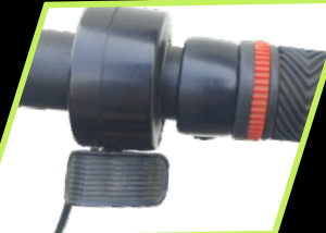
Throttle Simply Twist & go at 25km/hr speed