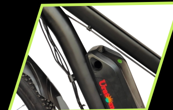
High Tensile Steel Frame