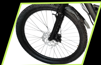
27.5 Wheel Double Wall Alloy Rim