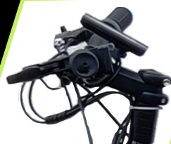
Wider Alloy Handle Bar