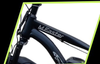
High Tensile Steel Frame