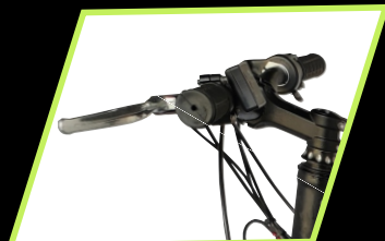
Wider Alloy Handle Bar