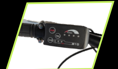
Smart LED Display