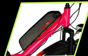
High Tensile Steel Frame