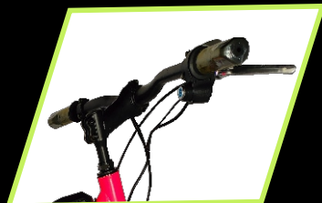
Wider Alloy Handle Bar